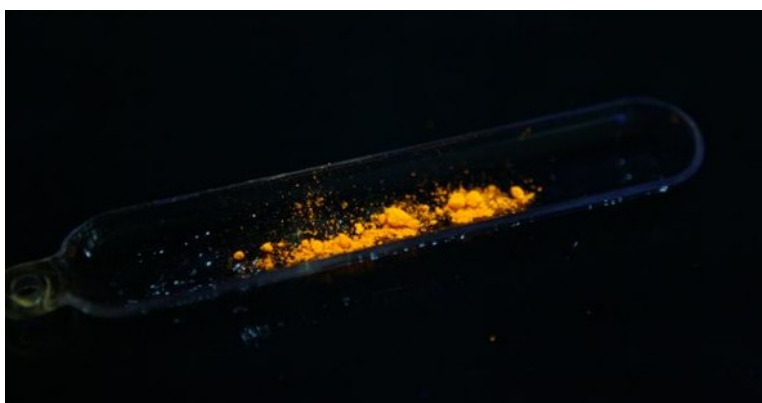
Excitation color at 366nm

All applications using this product should be thoroughly tested prior to approval for production.