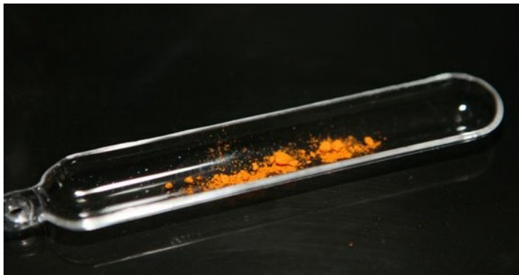
Appearance at visible light